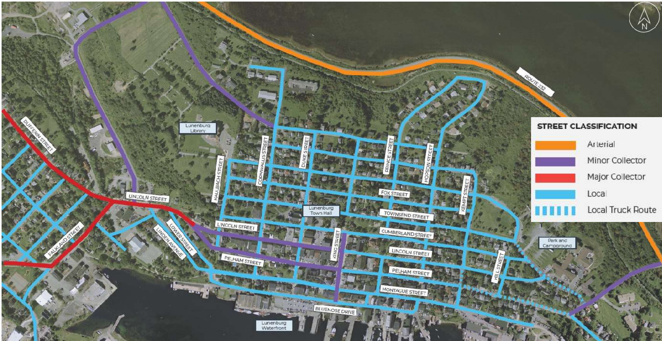
Figure 14: Street Classification Map