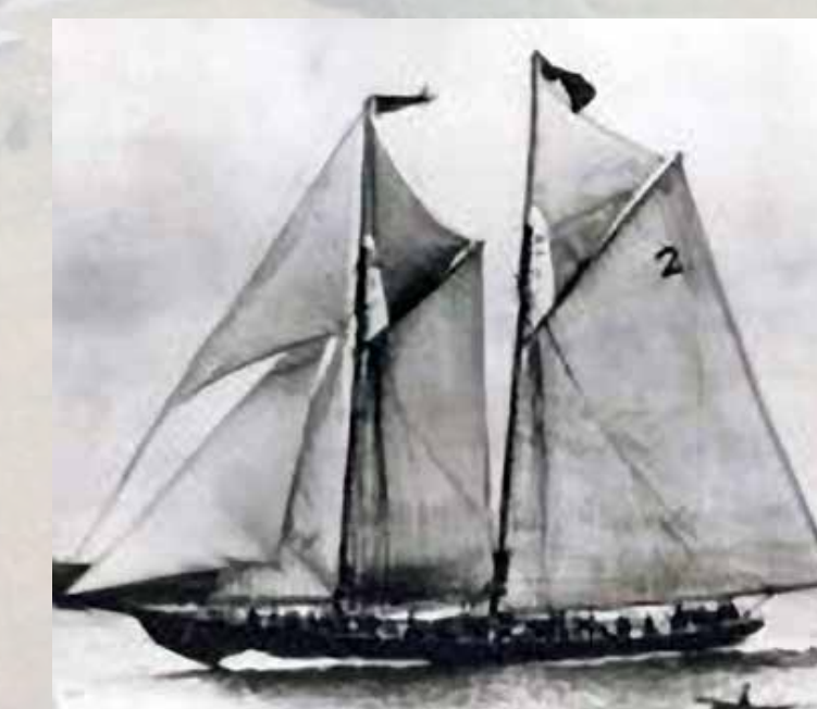
Bluenose Birth - March 26, 1921 Undeafed champion of International Fisherman's Trophy Race Date of Passing: January 29, 1946 - Wrecked off the coast of Haiti