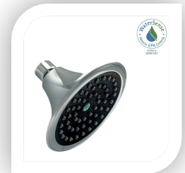
High efficiency attachments