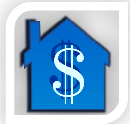
High water bills!