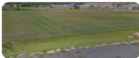
Soccer Field, $39/game