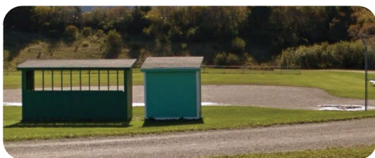
Baseball/Cricket Field, $16/game