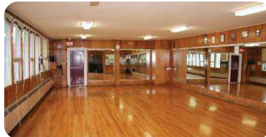
Fitness Studio, $32/hr