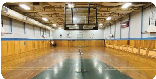
Auditorium, $41/hr, $51/hr w/ Kitchen